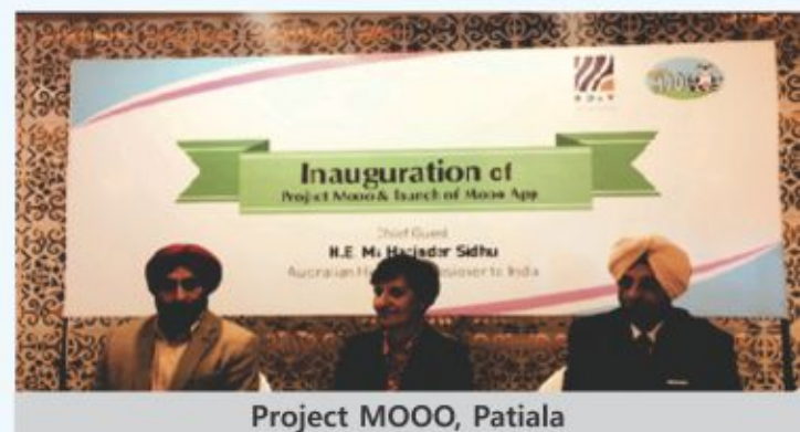
Project MOOO, Patiala

A major initiative has happened in Haryana wherein a MoU was signed with Haryana Horticulture Dept. & seven training centers. Agriculture as a vocational subject is being taught in 108 schools & assessment of 3,352 students in these schools were conducted.