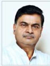
Dr. Mahendra Nath Pandey Hon'ble Minister Ministry of Skill Development & Entrepreneurship (MSDE)

"We have seen great potential, great energy & enthusiasm in the youth of the country & how they are adapting to new age skills, transforming their lives & contributing to the new India. If the program has been able to transform lives, it is because of the passion & grit with which the youth is participating in it. We are working closely with the States, Department and Industry to ensure a robust skill ecosystem which would empower the youth and create opportunities of employment for them"