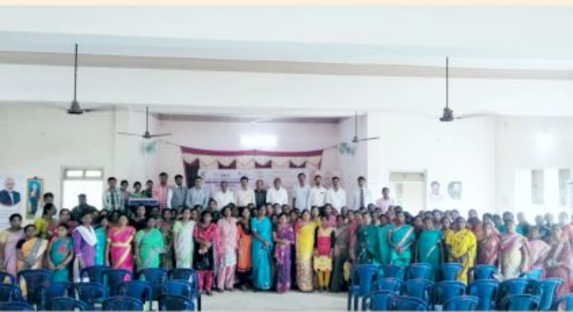
Rozgar Mela, Maddur