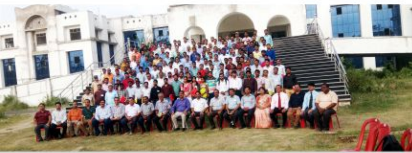
ToT at BAU Sabour

ASCI organizes Training of Trainers (ToT) and Training of Master Trainers (ToMT) Programs on a regular basis for various job roles across different geographical regions aiming to improve training delivery skills in the sector of their preference in alignment with NSQF