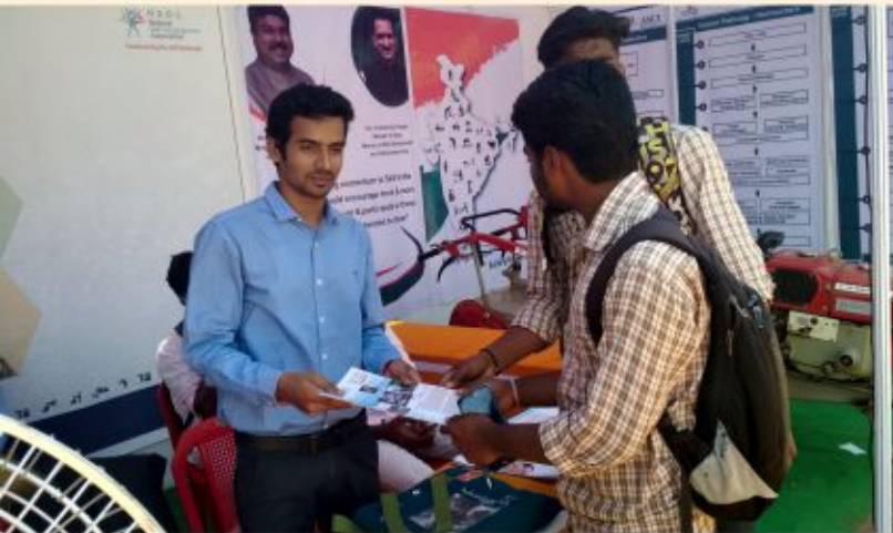
Rozgar Mela, Sirsi

Apart from this, ASCI also conducts standalone Job Melas in different parts of the country. Employers from Agriculture and allied sectors participate in Job Fair and undertake the placement process. Few companies who have participated are Coromandel International Pvt. Ltd., DCM Shriram, ICICI Lombard, Coromandel Agrico Pvt. Ltd., Shivshakti Biotechnology Ltd., Navbharat Fertilizers Ltd., Jaykishan Horticulture Ltd., Ananda Dairy, KisanKraft, Escorts Crop Solutions & Women Organisation For Socio Cultural Awareness, National Collateral Management Services Limited, Willowood Cropscience Pvt. Ltd., Gramophone.