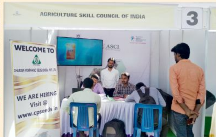
Rozgar Mela, Belgaum