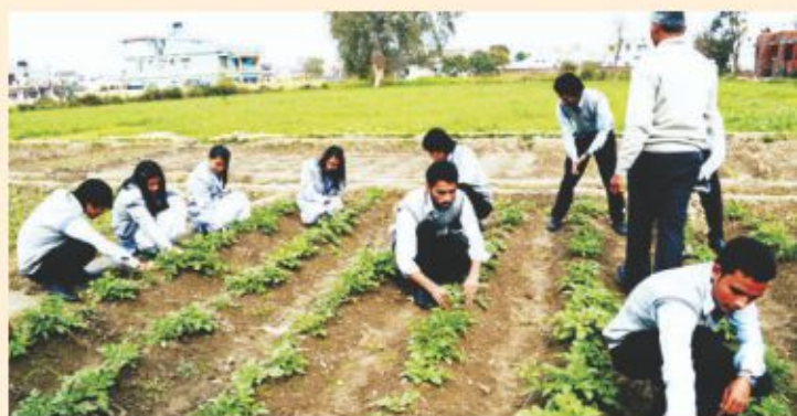
Training at School

In Maharashtra, Agriculture got introduced in 30 new schools apart from Multi Skill Programs which is going on in 228 schools which sums up to 258 Schools.