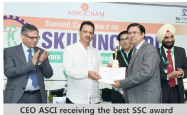
CEO ASCI receiving the best SSC award

This award is in recognition of Agriculture Skill Council efforts that have supported the development of standards, facilitated flagship Skill Development programs, introduction of vocational courses at School, College and University level both in cities and in rural areas.