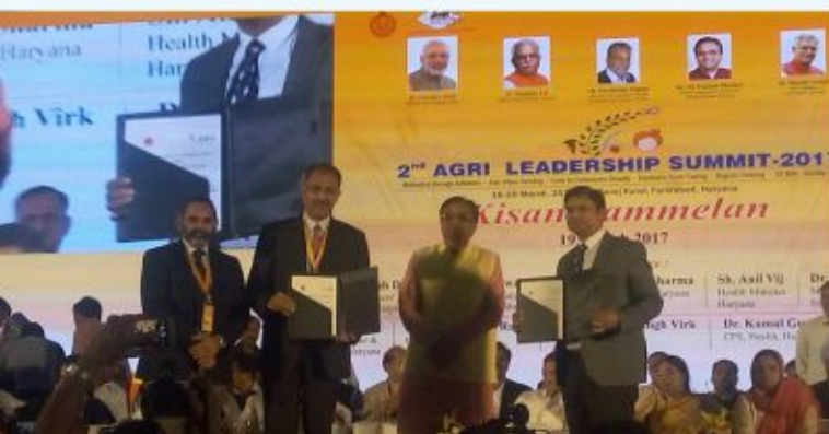
MoU signed between ASCI and Haryana Horticulture Dept.