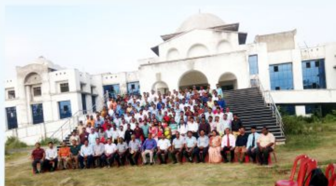
ToT at BAU Sabour

It is expected that the second green revolution of our country will be from the eastern region of India and Bihar will be the hub of it. Bihar Skill Development Mission (BSDM) has started their batches of training under state skill development mission scheme and they have included 34 Agricultural Job Roles. ASCI has successfully conducted a 10 days Training of Trainers for the record 203 Participants for 10 job roles at Bihar Agricultural University, Sabour in 2018 which is one of the biggest ToT.