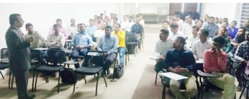
ToT at Pune