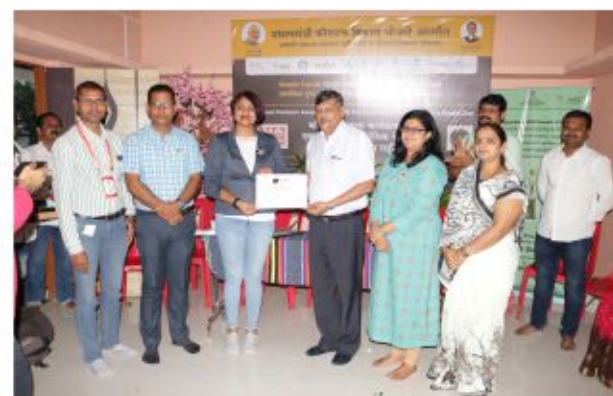
ASCI created India & Asia Book of record