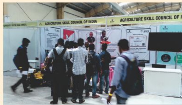
Rozgar Mela, Balasore